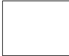
Insert School Logo